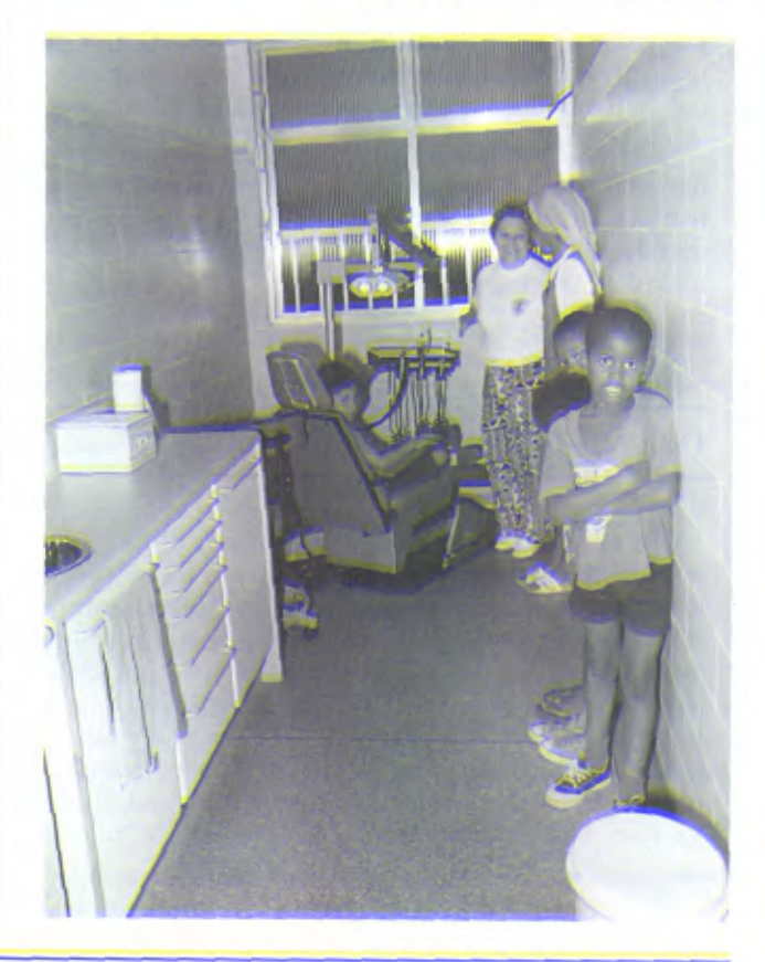
Abel Institute, Niteroi: Dental Service, promoted by the Lasallian Family.

The positive effects were noticeable in the school atmosphere as they went on in their educational endeavors. Those persons came together as a true Lasallian Family and together they shared the mission. And this was all due to the fact that Jesus lives in our hearts!