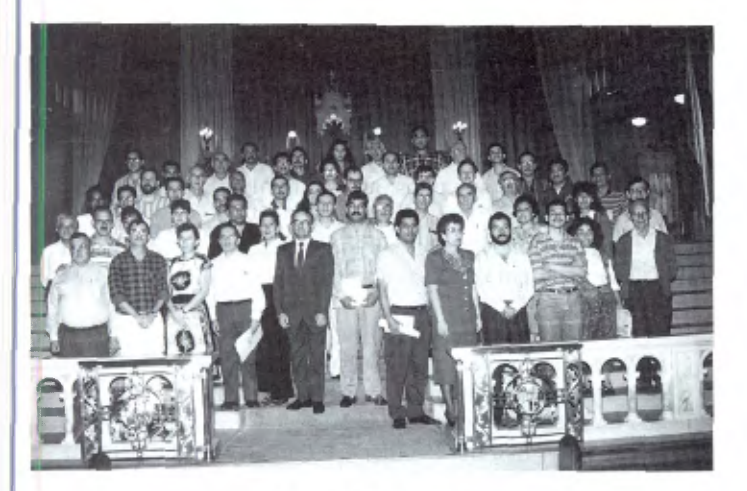
District of Medellin: the Brother Visitor with the Brothers and lay teachers of the District after a Lasallian formation session.