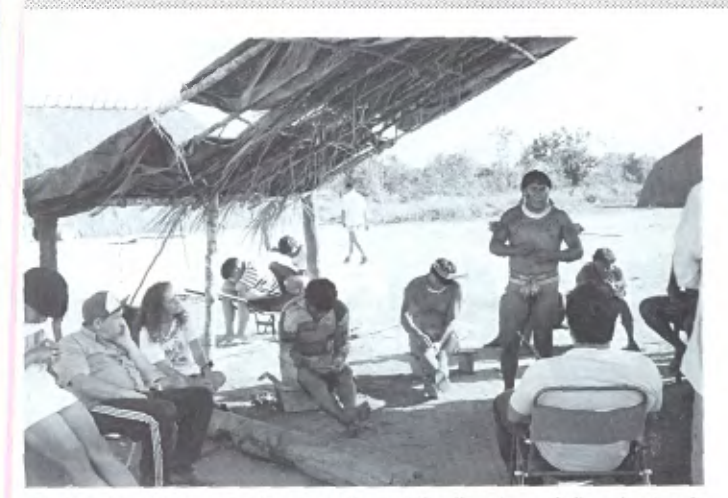
Kalapalo natives mission: meeting of the "caciques" (local rulers) with the Lasallians to discuss education within the village.

The teachers of the São Carlos Center as well as the Kalapalo natives are very pleased with this project.