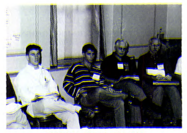
District of Baltimore, November, 1994: Brothers and lay people discussing the Shared Mission guidelines.

3. Currently what aspects of your professional life and your relationships with other members of the school community, with