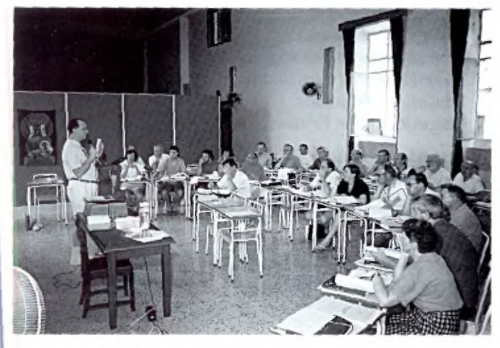
Malta: A work session during a teacher's workshop.

The program is in operation throughout the school year and attendance is voluntary.