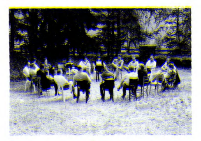
Turin: Sharing ideas about the Mission during a CELAS session.

Given the fact that the Lasallian Family should be committed to the Shared Mission, it would be appropriate that this commitment be carried out in some way within the school.