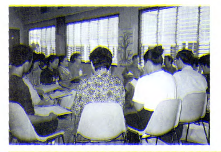
Philippines: Teachers from Visayas-Mindanao at a LASSA meeting.

- These workshops have been held yearly and their benefits are evident in meetings of boards and administrative teams. The tenth such workshop was held in September, 1994 in Bacolod City.