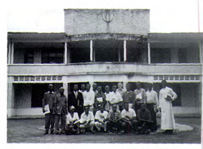
Kinshasa, Zaire: Lasallian Family Commission.