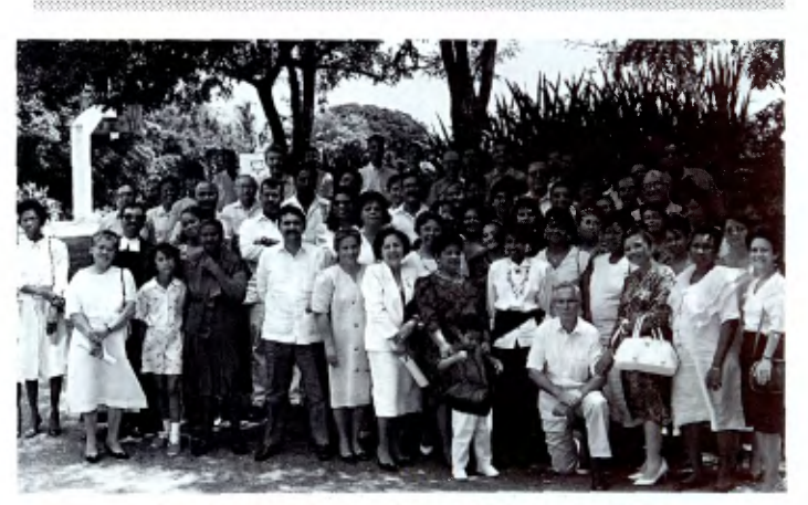
Dominican Republic, May 9, 1992: certificates of gratitude awarded to Lasallian Family members.