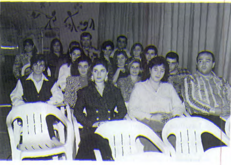
Lebanon: Formation session for Lasallian teachers.