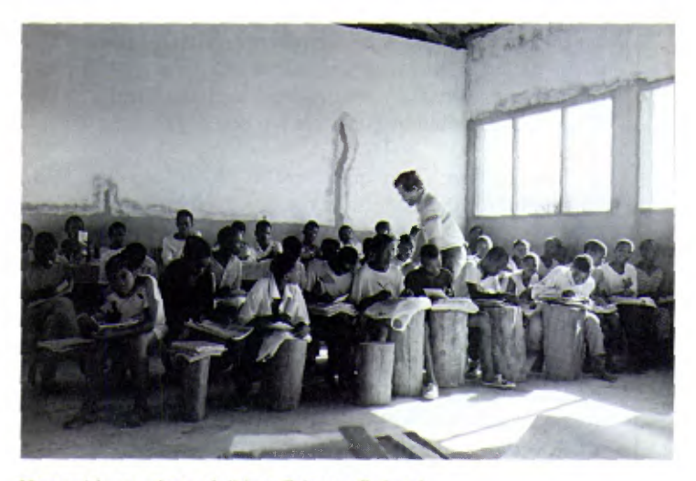
Mozambique: class visit in a Primary School in the Mission of Estaquinha.

Some 265 persons have participated in this program so far (1995) including some parents.