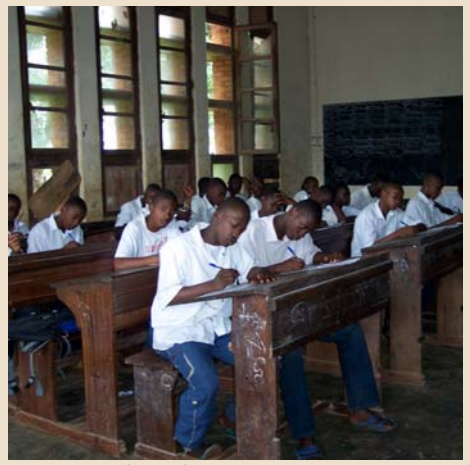
2862 Tumba (Congo)