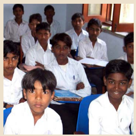
2756 Khushpur (Pakistan)