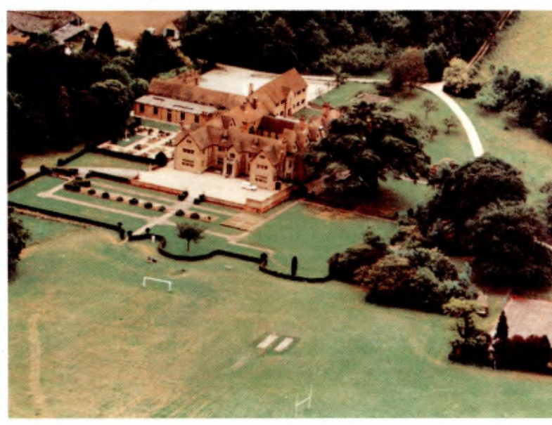
Kintbury: Aerial view of Kintbury.

Photo on back cover: John Baptist de La Salle gave his whole life to the Christian education of young people. (Stained glass window in the Mother House in Rome).