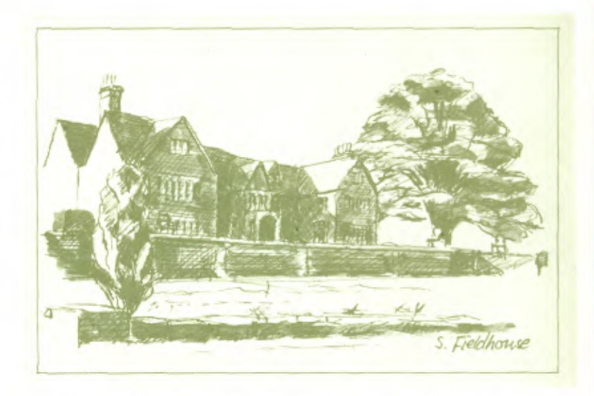
Kintbury (England): Wallingtons, now St. Cassians's Centre, where, over the last few years, some remarkable work has been done in catechetics and spiritual renewal (meetings, congresses, retreats).

For the last nine years the community has welcomed groups of young people who commit themselves to live and work with the Brothers for at least a year. For the last five years this group of young people has included young women. These young people wish to grow in faith, to work to build community — with each